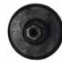
INNER PISTONS Hexagonal stem 7

Using a Philips head screw driver, loosen the 4 cam piston screws and pull cam apart from the outer piston. (Both pistons should be replaced when a new diaphragm is fitted). Pull Inner Pistons (7) free from Outer Piston and remove the Diaphragm. Slightly bend outer piston (4) along pre-moulded crease to aid removal.